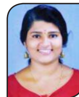
Vismaya University Chess Team Member B.Com Regular