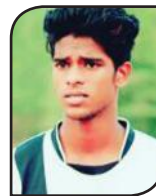
Manobin National Team Selection Dept. of Physics