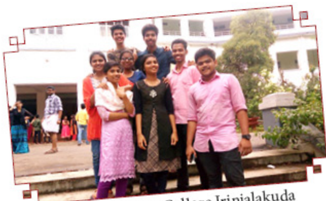
Camp at Christ College Irinjalakuda