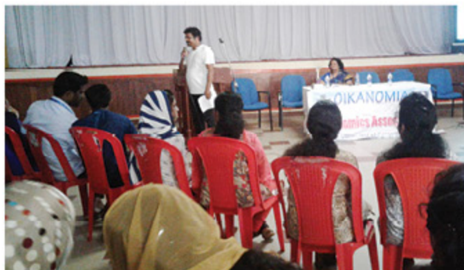
A departmental debate was conducted on 'Impact of GST on Indian Economy' as part of study on Fiscal Federalism by the department of Economics.