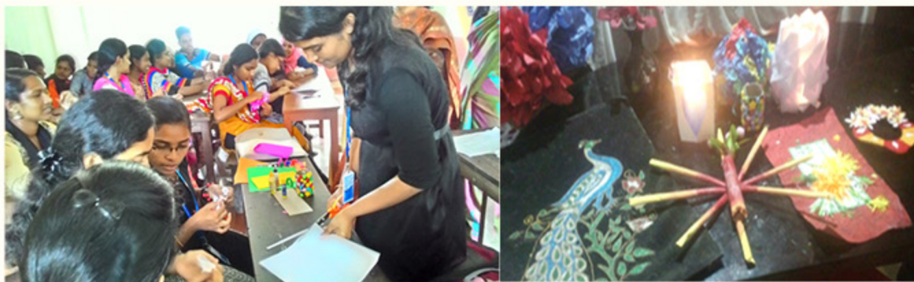
A workshop conducted by Fine Arts club