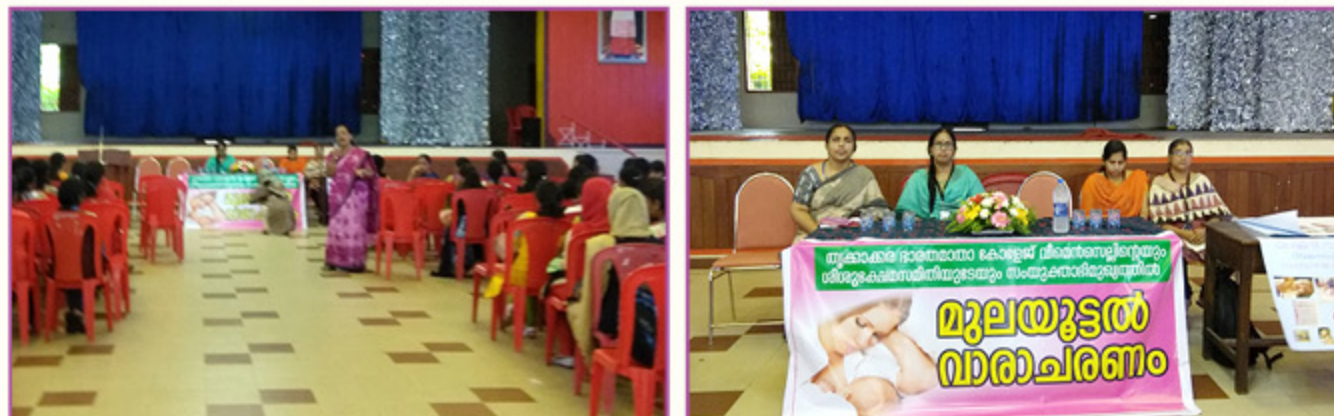
An Awareness Programme conducted by Women's Cell during the breast feeding week celebration