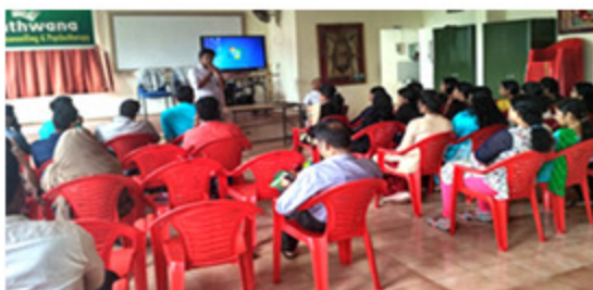
Students Observation Visit to Santhwana Institute of Counselling and psychotherapy. A first year student delivering his feedback about the observational visit