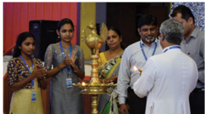
Physics Association Inauguration