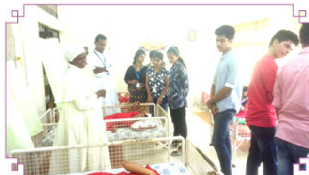
Visit to Home of Providence, Vilangu