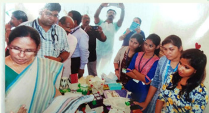
Exhibition cum sale of the handmade products prepared by the mentally challenged patients and MSW intern students at OOLAMPARA Mental Health Centre