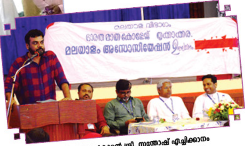
പ്രമുഖ എഴുത്തുകാരൻ ശ്രീ. സതോഷ് ഏച്ചിക്കാനം മലയാളം അസോസിയേഷൻ ഉദ്ഘാടനം ചെയ്യുന്നു.